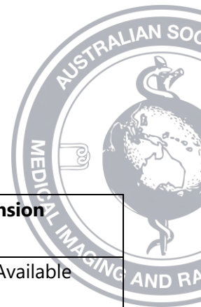
Table 1. CMP Certification Requirements.